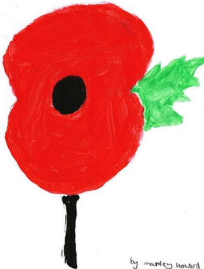
by marley howard

Don't forget to download your Poppy poster – it can be found on the Legion website.